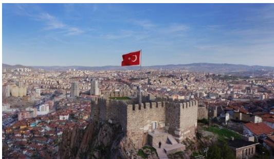
↓↓ Ankara Castle ↓↓